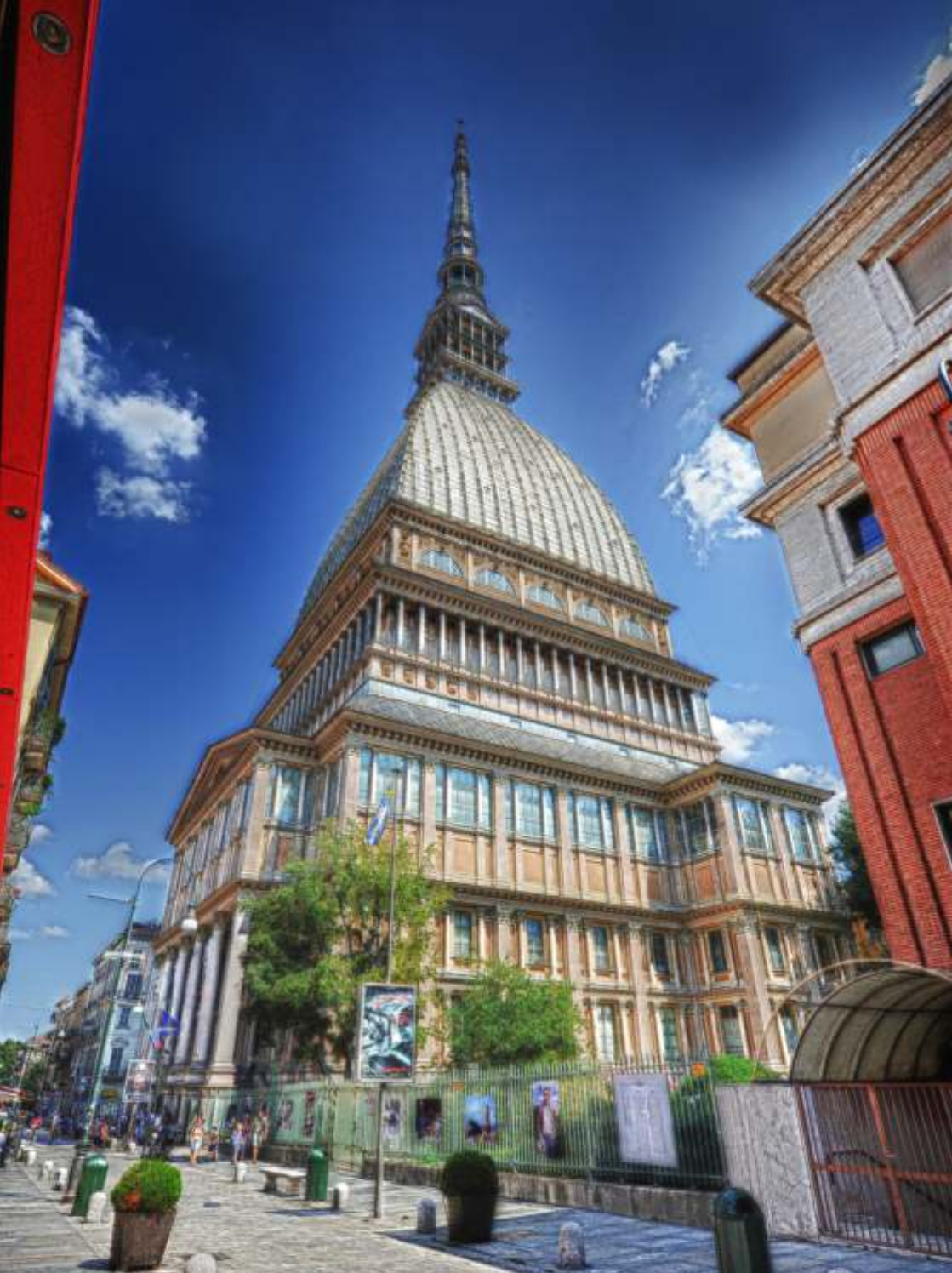
View of the Mole Antonelliana, in Turin