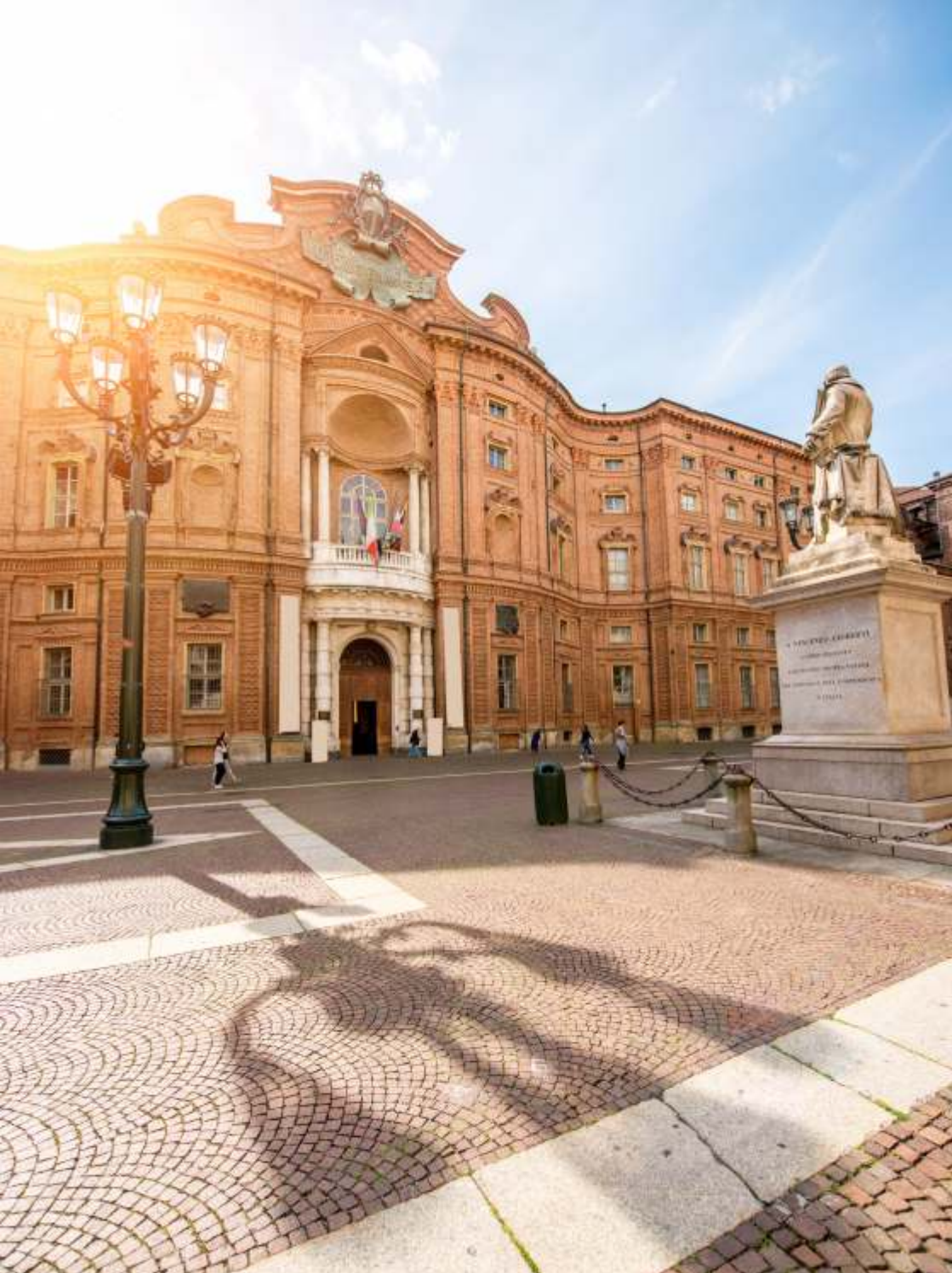
Carignano square with Vincenzo Gioberti statue in the old city center of Turin